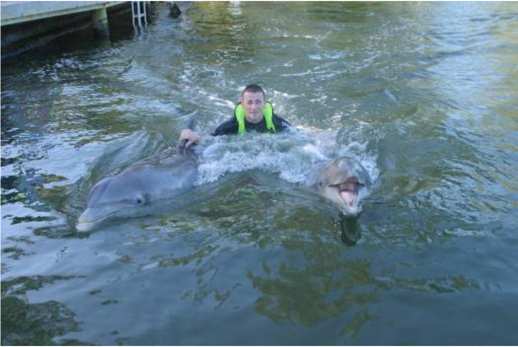
And saw me off